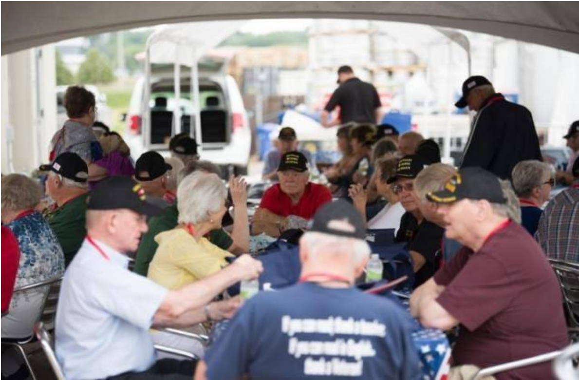
Veterans enjoying the day.