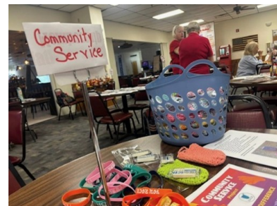
ALA Department of Delaware