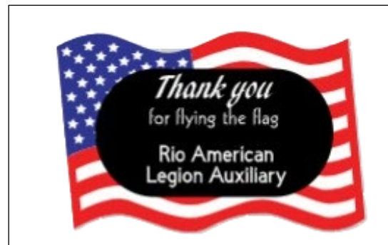
Given to community members who fly their flag at home.

Promote these programs, contests and information to those in your community. We need to continue informing our youth about Americanism.