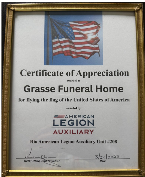
This image can be found on the Grasse Funeral Service website.

These are just a few examples of what you can do to promote Americanism in your area. They appear to be easy to complete but they are significant to the recipients. Businesses enjoy receiving and proudly displaying the “I Spy, You Fly” certificate, that can be found on the Wisconsin American Legion Auxiliary website under Americanism.