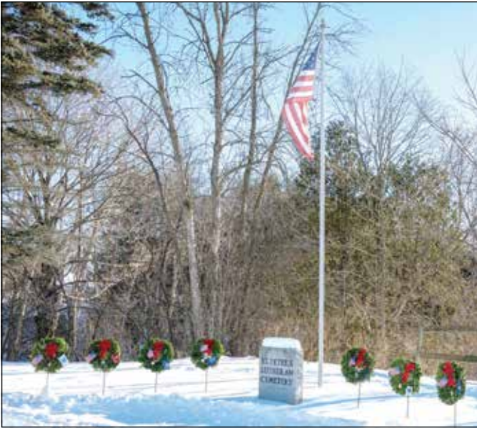
Thank you to all the volunteers who made donations or helped place wreaths on graves throughout Wisconsin.