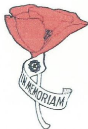
American Legion Auxiliary

A registration form is included in this unit mailing.