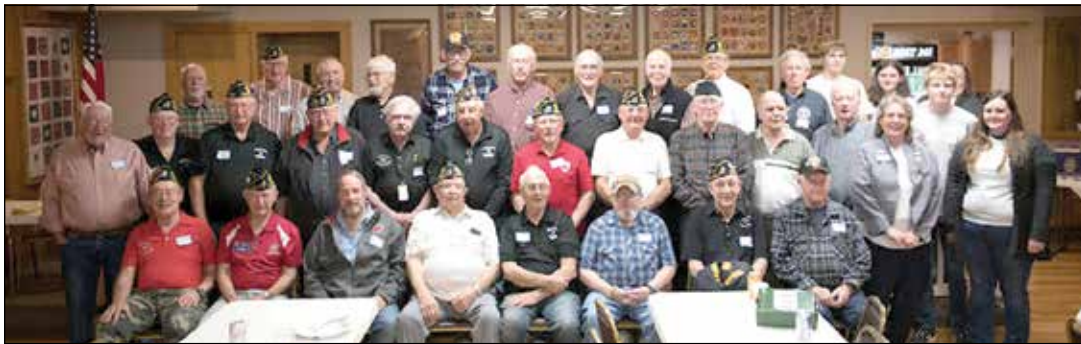
The Daughters of the War of 1812 were on hand at Cross Plains-Middleton Post 245 at their April Legion, Auxiliary, SAL monthly meeting to present pins and certificates to Vietnam Era Veterans along with a thank you and Welcome Home message. They, along with three Dane County Veterans Service personnel were treated to a fine meal and local hospitality.