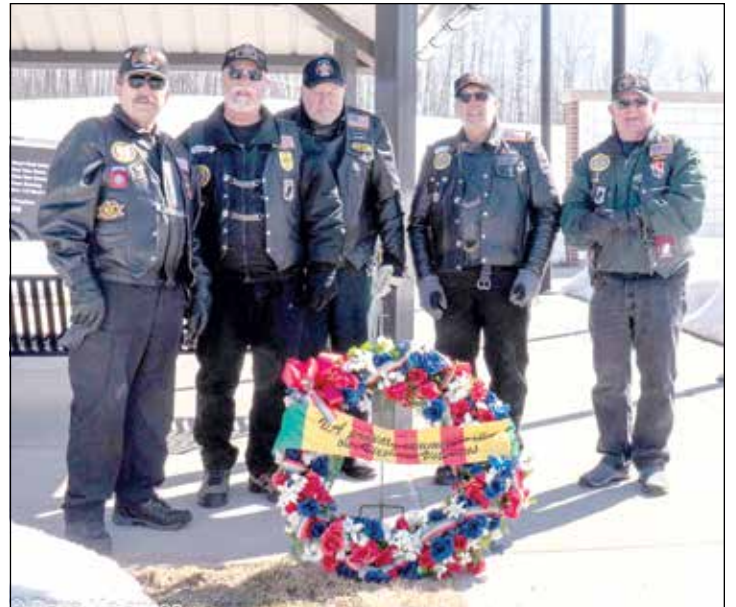
District 11 American Legion Riders took part in the March 29 Vietnam War Day ceremony. It was held at the Northwoods National Veterans Cemetery in Harshaw.